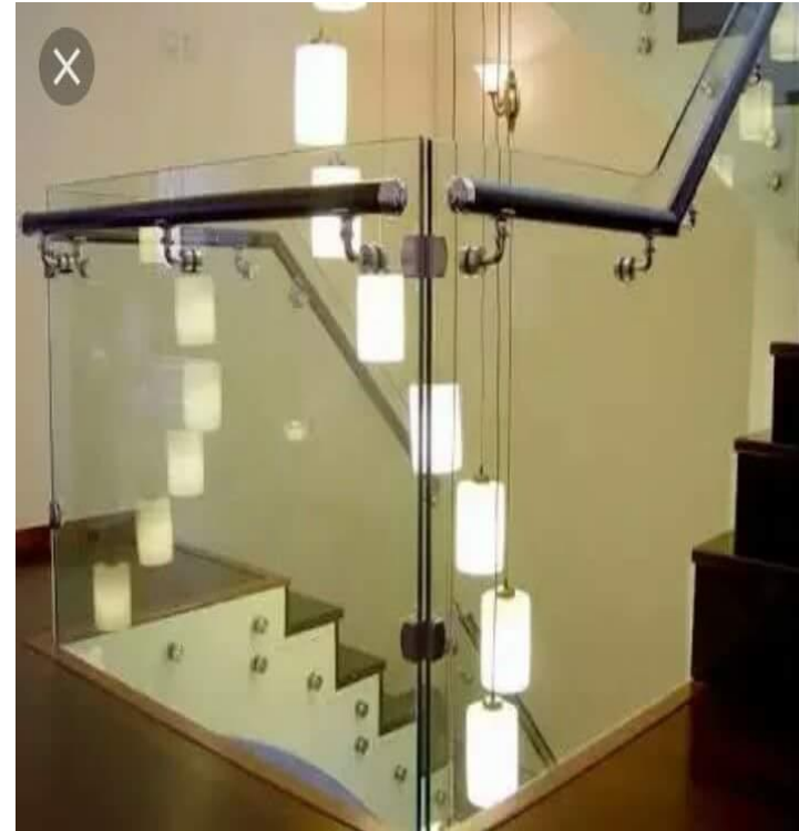
Frameless glass handrail