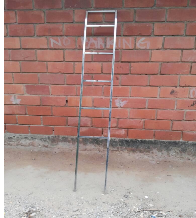
Stainless steel ladder