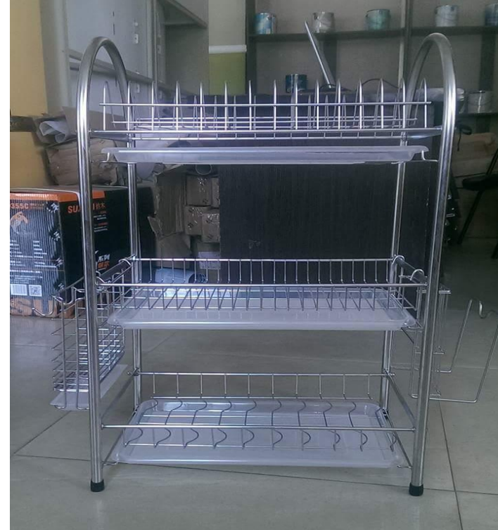
Plates rack with stainless steel