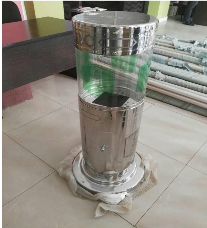
Donation box with stainless steel