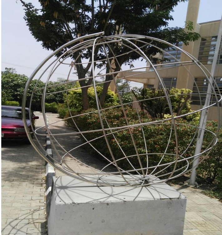
Globe with stainless steel @ Distance Learning, Abuja