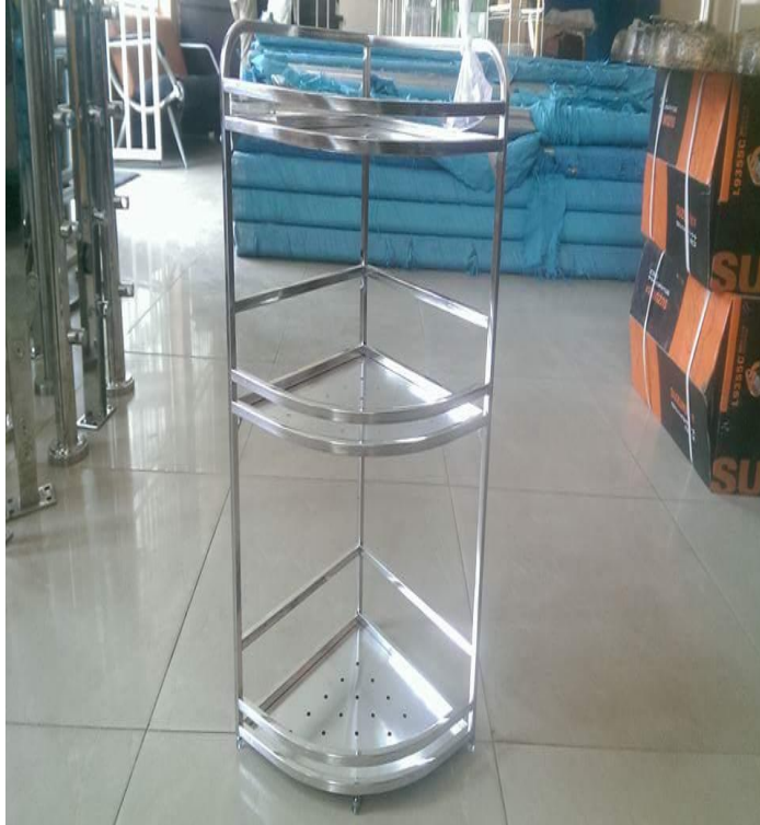
Glass cup rack with stainless steel